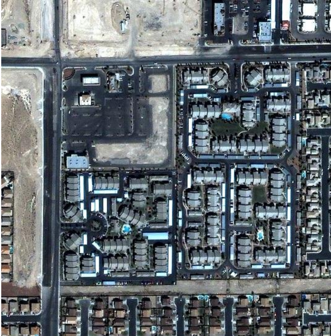
Figure 1b. True color Ikonos imagery for a section of Las Vegas, Nevada.