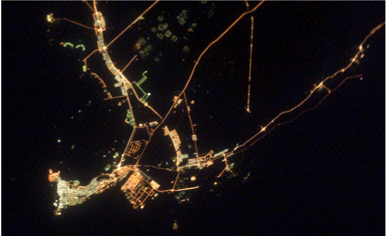
Figure 3: Washington, DC and Abu Zaby (United Arab Emirates) imaged at night from the International Space Station (ISS). The resolution of the imagery is approximately 60 meters. Note that orange, green and white lighting can be discerned. It is likely that the orange lights are from sodium vapor lamps. The linear features are roads lit by string of streetlights. The ISS cities at night digital photography demonstrates the feasibility of collecting moderate resolution multispectral low-light imaging data globally from a satellite platform.